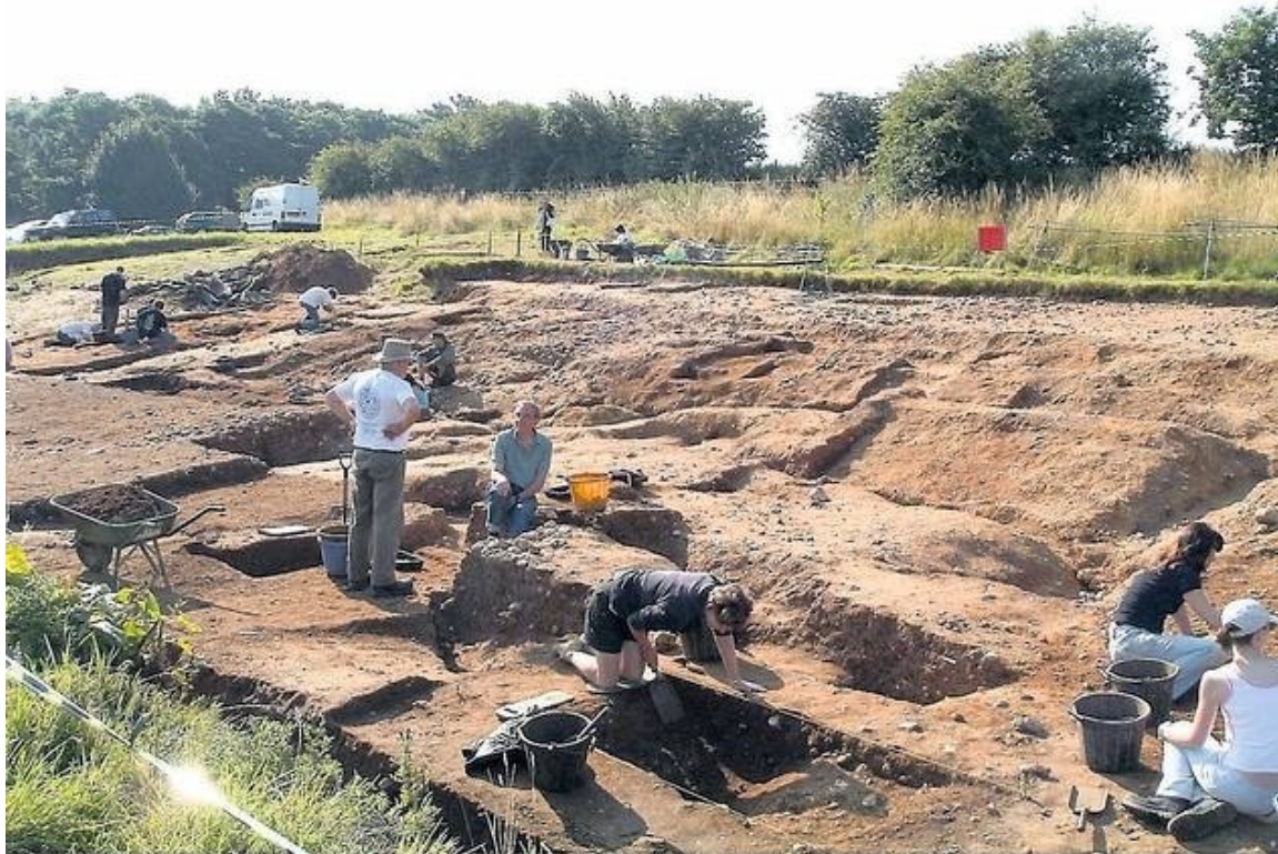
Archaeological dig at Sedgeford

later – while the relocation of the village from south to north in the 11 th century AD remains a major focus of research. SHARP has carried out exploratory work at West Hall, on the site of a moated manor, and at the parish church of St Mary the Virgin, as well in the village itself. There is antiquarian evidence of Pagan Saxon funerary urns and metal detectors have revealed at least one major cemetery of this date: this has generated another set of questions.