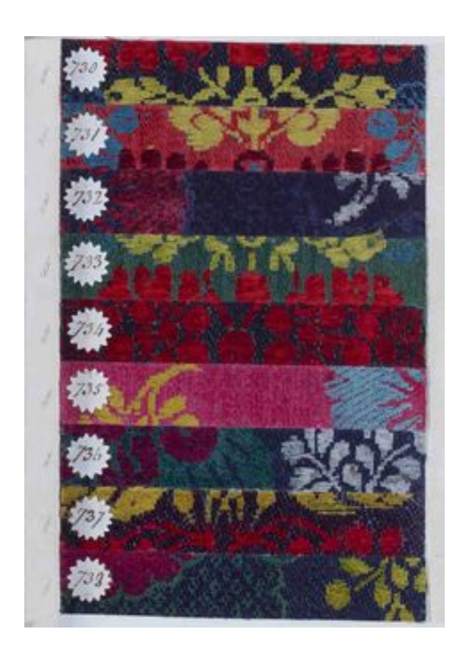
Swatches from the Charles Tuthill pattern book 1800–1809 (NAS, 1957.384)