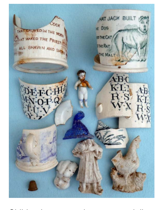
Crockery from Guston