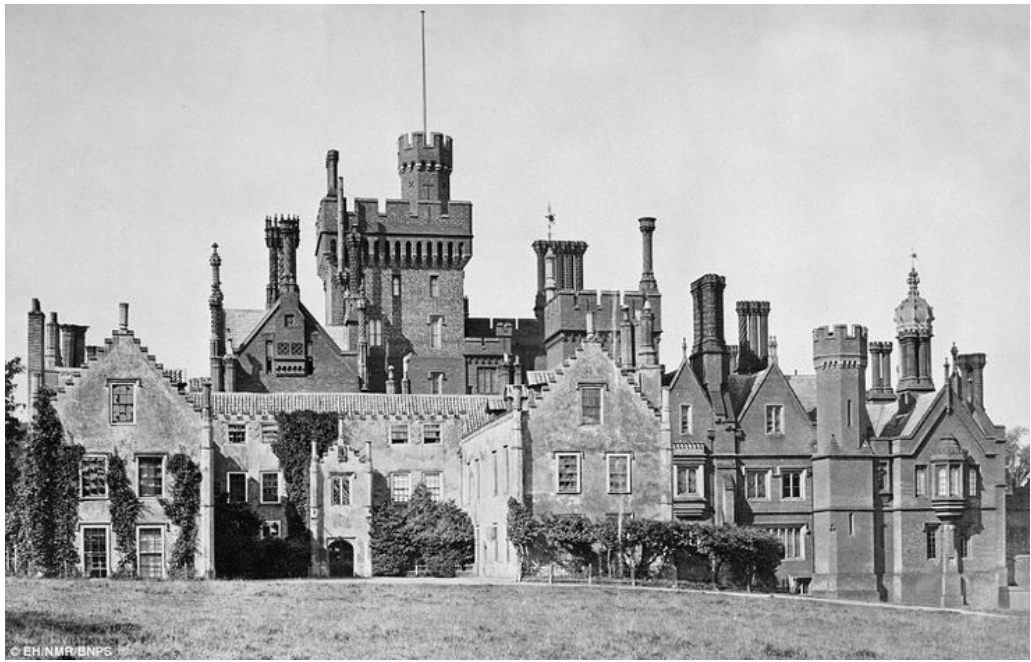
The old Costessey Hall

Quantifying the effect is difficult – probably about one hundred houses were requisitioned and 20 later demolished with partial survival of others. Many were in a poor state to begin with and some were very vulnerable particularly the large Country Houses like the rambling, gothic Costessey Hall which ended up being demolished. Victoria mansions were out of fashion whereas Georgian palladian, classical structures survived. Haveringland demolished 1946; Wretham demolished 1948; Didlington demolished 1950; Old Buckenham destroyed by fire 1952; Hunstanton was sold in 1951, turned into flats but seriously damaged by fire in 1952; Morton Hall was pulled down 1952; Bawburgh Hall demolished in 1963; Honingham sold 1964 and demolished 1966.